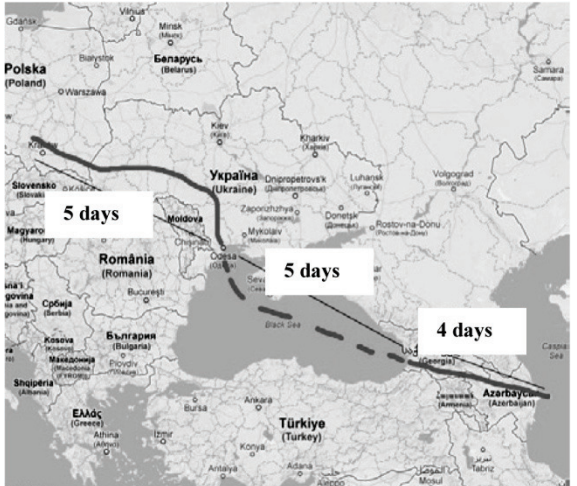
Fig. 4. Minimum transit time of road/rail transport: (left) from Afghanistan to Azerbaijan, (right) from Azerbaijan to Poland Personal elaboration