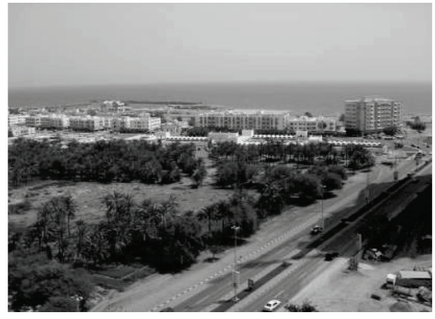
Fig.7. Road in Afghanistan and Al Fujarah seaport (UAE)

In case of airlift (variant no 4) assuming that there are approx. 500 containers and approx. 300 trucks and two AN-124 per day are at our disposal, whole equipment would be moved back within 40 days. Of course in practice it is not possible firstly