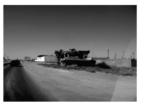
Fig. 3. Rail and road infrastructure in Kazakhstan.

The second variant – the Central corridor is divided into several phases to calculate time of equipment movement (Figure 4). Analysis shows that minimum transit time is 25 days.