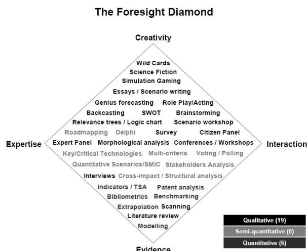
Fig. 2. Foresight diamond