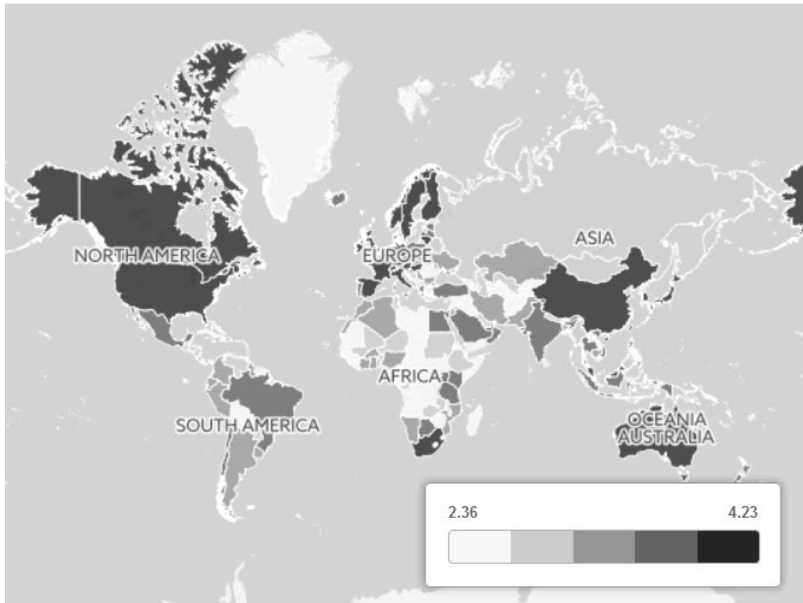
Fig. 1. LPI index describing Poland's position in the years 2007 - 2016. Source: own study based on data from The World Bank [8].

Analysing the data one can get an impression that the position of Poland is as satisfactory as possible. Against the background of global regions, we rank above the average, with the value of 2.88. This is illustrated by the graph below: