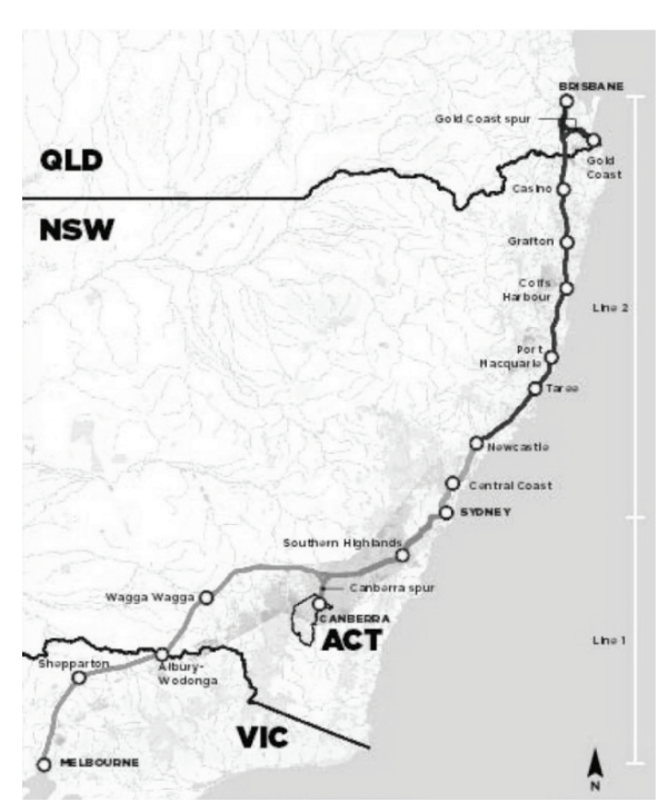
Fig. 3 Planned railways for high speed trains – stage 2. Source: Department of Infrastructure and Regional Development;

www.infrastructure.gov.au/rail/trains/high_speed; Chapter 6:Staged delivery (12.03.2015).