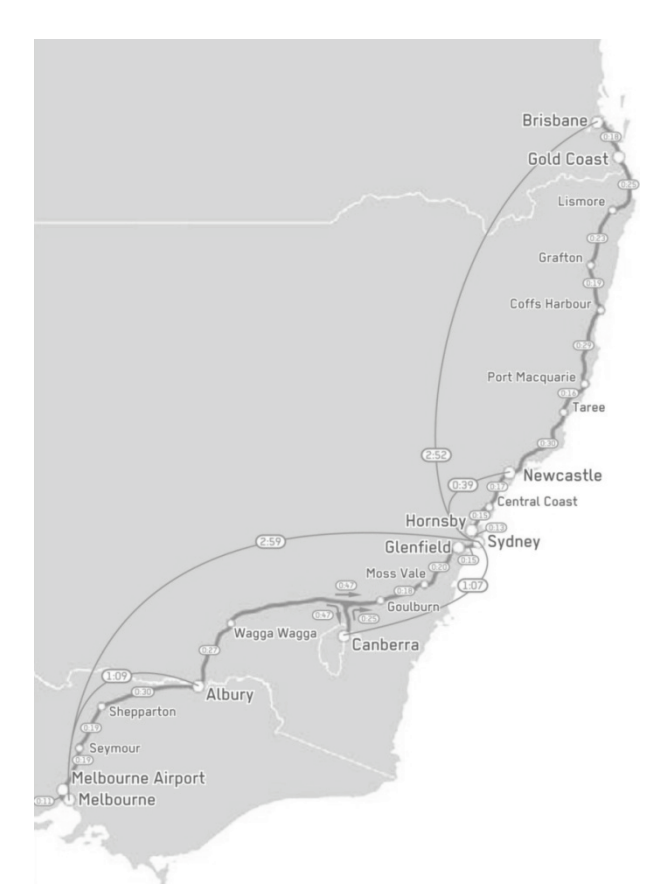
Fig. 4. The HSR route suggested in the Zero Carbon Australia High Speed Rail document, along with the planned journey time.

instead of 1,748 km (Fig. 4). At the same time the length of tunnels was decreased by 44%, and bridges by 25%, assuming greater use of the existing transport corridors. The document criticized not only the 45-year construction schedule, but also the cost of the complete transport corridor planned in stage 2. According to the forecasts of BZE the investment can be completed within 10 years (the completion is planned for 2025) with the financial expense of $84.3 billion. To confirm the possibility of realizing the investment in an apparently ambitious time of 11 years, the foreign railway projects are mentioned. Only the financial aspect of the investment remains the barrier.