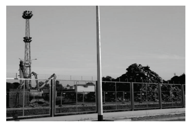
Fig. 3. Landfill scrap at the French Quay (Gdynia)

The local authorities in the city of Gdynia have planned to renovate the historic building of marine station in the period from 2014 to 2015 and open the Museum of Emigration here.