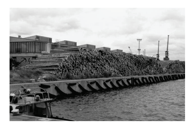
Fig. 4. Wood storage at the Pomeranian Quay (Gdynia) Source: author's photo, 2013.

In Gdynia, cruise ships are also occasionally targeted to the United States Quay that is much cleaner but it is also located in the area of the port where, among the others, the ro-ro and container ships are supported. Cruise ships also call at the Polish Quay, which is soon to be rebuilt into a modern ferry terminal. It is necessary to underline that the Pomeranian Quay, located in the heart of the city of Gdynia, is the most desired quay by tourists and cruise shipowners. This quay is equipped with souvenire shops, information centre, lots of cafeterias, restaurants and fish bars etc. It has also excellent communication accesibility to the city centre. So far, however, this quay has been occasionally